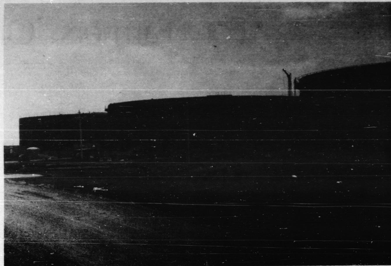
The crude storage tanks at the Texaco Refinery are nearing the final stages of completion. Inside each tank is a floating deck, which rides on top of the oil and prevents hydro-carbons from escaping into the air.

It is hoped that all animal and bird lovers will try to get out to this meeting to find out what we might be doing to prevent abuse to animals. For any further information or suggestions, get in touch with Mrs. V. Harker - 426-3571.